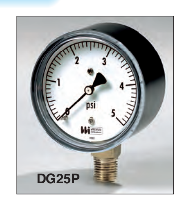
Ex: DG25P-005-4L Pressure Dial 0-5 PSI, 1/4" NPT Lower Connection