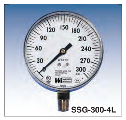
Zero Zone indication, a standard feature on these gauges, reduces the potential risk of installing a damaged gauge on your equipment.