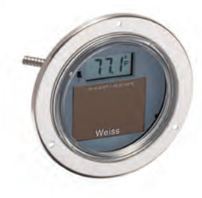
DV35QB5 - U-Clamp, Panel Mount