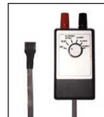
SA200 - Basic Service Tool

The tool is used with a voltmeter to check and adjust the settings of the alarm levels and sensor offset of gas detectors and control panels.